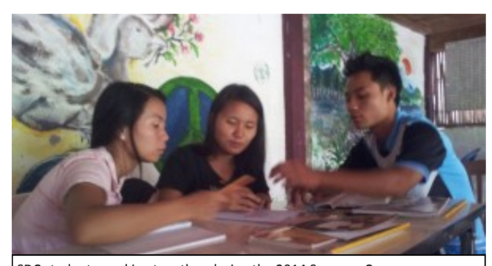
SDC students working together during the 2014 Summer Course

During the course, we will develop student's English to focus on talking