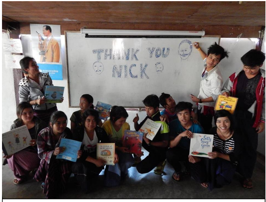
SDC students with the donated books and a thank you message