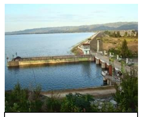
Lawpita Dam in Karenni State

I grew up in camp. I started school at age 3 years old in the nursery school. I went to primary school, middle school No2 and high school. I studied with friends then I played football. When I went to school, I went to study science, maths, history, English and Thai. I was happy with my friends and teachers. I was interested in SDC school because i want to know about human rights, rule of law, environment, and democracy. These subjects are important because i went to empower our Karenni people.