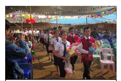
Students arriving at the ceremony to take their seats