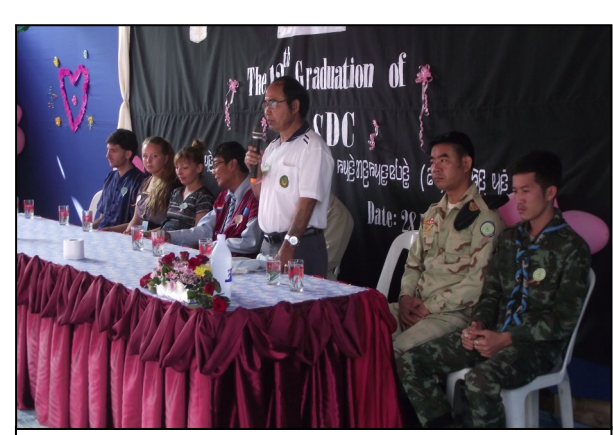
The chairperson of the Karenni Refugee Committee gives a speech